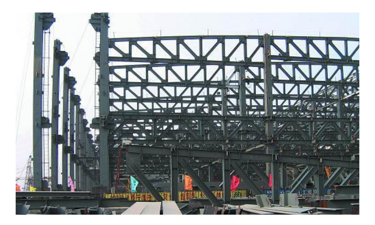
8,000 m<sup>2</sup> Yacht Manufacture Workshop at (Taiwan) Dongchang Yacht Co. Ltd

PROJECT (heavy steel structure) received a total investment of US$ 1 billion. Part of this project was completed by TASHYEED.